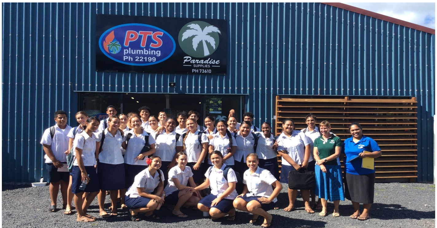
Level 1 Business Class visiting Paradise Supplies