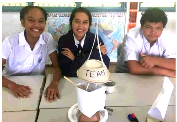
Younger members of the BraveThinkers group—teamwork