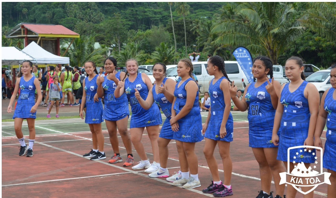
Te Manga 13/U Netball team—posing before their first game against Maungaroa. Anau Te Manga had a clean sweep in all grades of netball on Friday