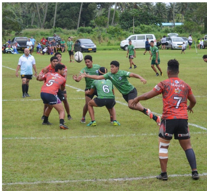
Maungaroa take on Te Kou in the 17/U grade

Netball: 13/U Te Kou 2 v Nukutere 11; Maungaroa 4 v Ikurangi 5; Te Manga 8 v Maungaroa 3; Te Manga 13 v Te Kou 6; 15/U Ikurangi 6 v Titikaveka 9; Maungaroa 7 v Nukutere 10; Titikaveka 6 v Maungaroa 16; Ikurangi 5 v Te Kou 6; Nukutere 6 v Te Manga 10; Te Kou 1 v Te Manga 11; 17/U Te Kou 7 v Maungaroa 5; Nukutere 18 v Ikurangi 3; Ikurangi 3 v Te Manga 7; Nukutere 12 v Te Kou 9