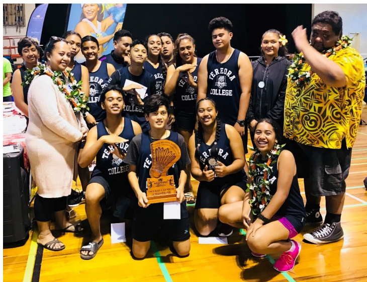
Tereora College Badminton Champions 2018