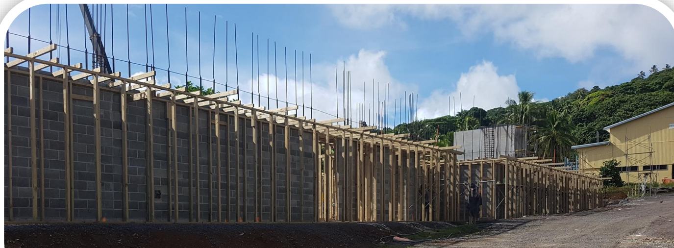
Ground floor of the Research and Administration Building

T ereora College's very own 1st XV rugby team will be having a warm-up match at the BCI stadium on Thursday 13th of April. The boys, who are ready to showcase their rugby talents as well as skills will be kicking off at 1.30pm. The public are more than welcome to come along in support.