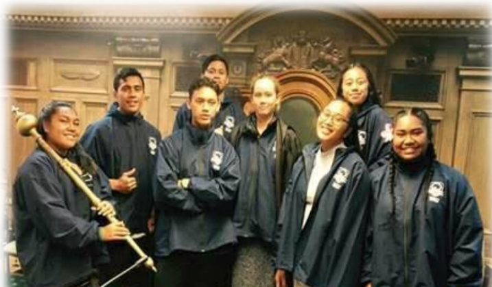
Level 3 Media students photographed inside the New Zealand Parliament House

The students will be able to share some of their assessment work, some of the learning strategies, and also give them a sneak peek into what their classroom has been like this year.