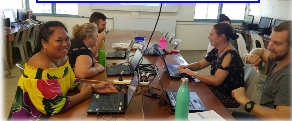
Members of the English Faculty during the first day of Term One holiday break

This supports our theme for professional learning for teachers in 2017.