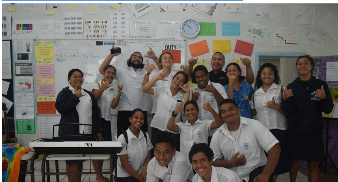
Guest Opera singers captivate students