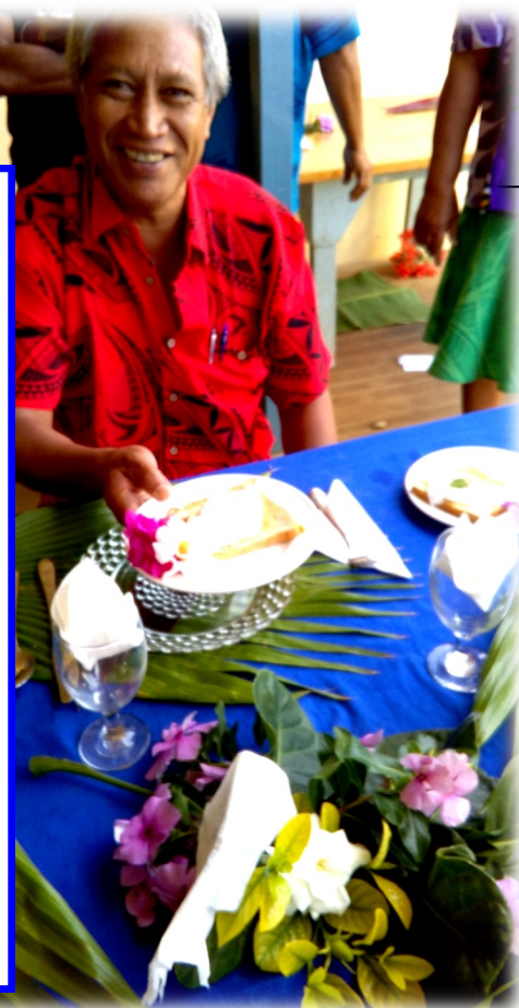
Table-setting, poached & scrambled egg making, herb & spice testing and experimenting with smoothies was all part of the mornings' activities.

E-services available. Top-ups, wi-fi vouchers & kia orana calling cards.